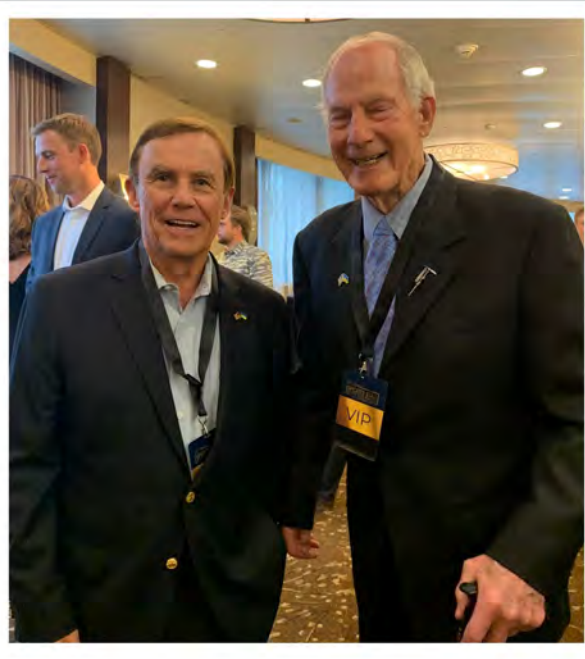
(Left) With Shawn Kemp and Lenny Wilkens; (Right) With Jim Whittaker