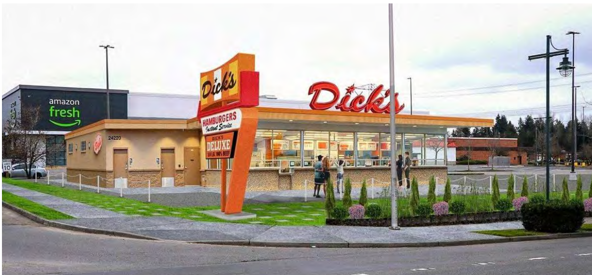
Mockup of the Dick's Drive-in Federal Way branch