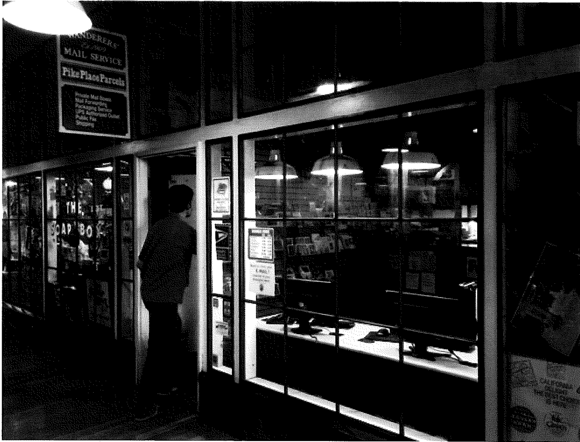
1916 PIKE PL, SEATTLE 98101