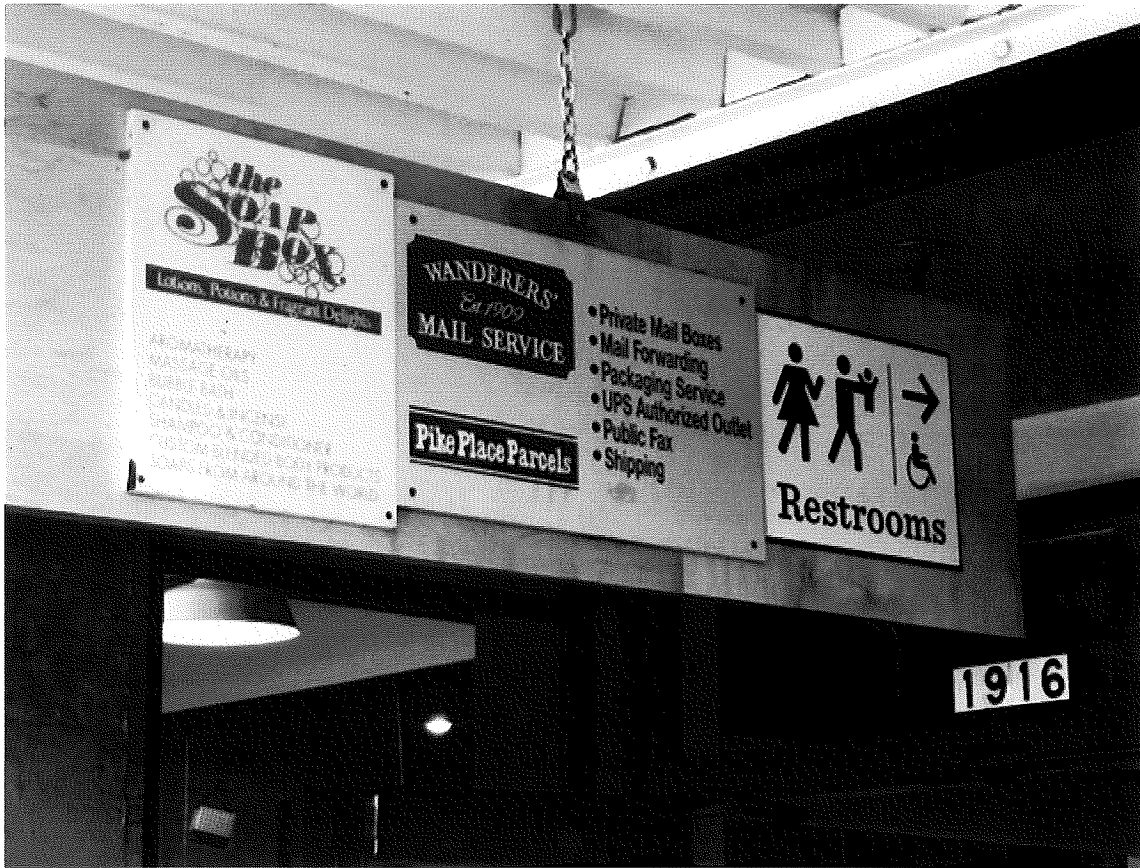
1916 PIKE PL, SEATTLE 98101