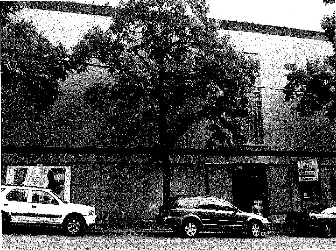
6920 Roosevelt Way NE, Seattle 98115