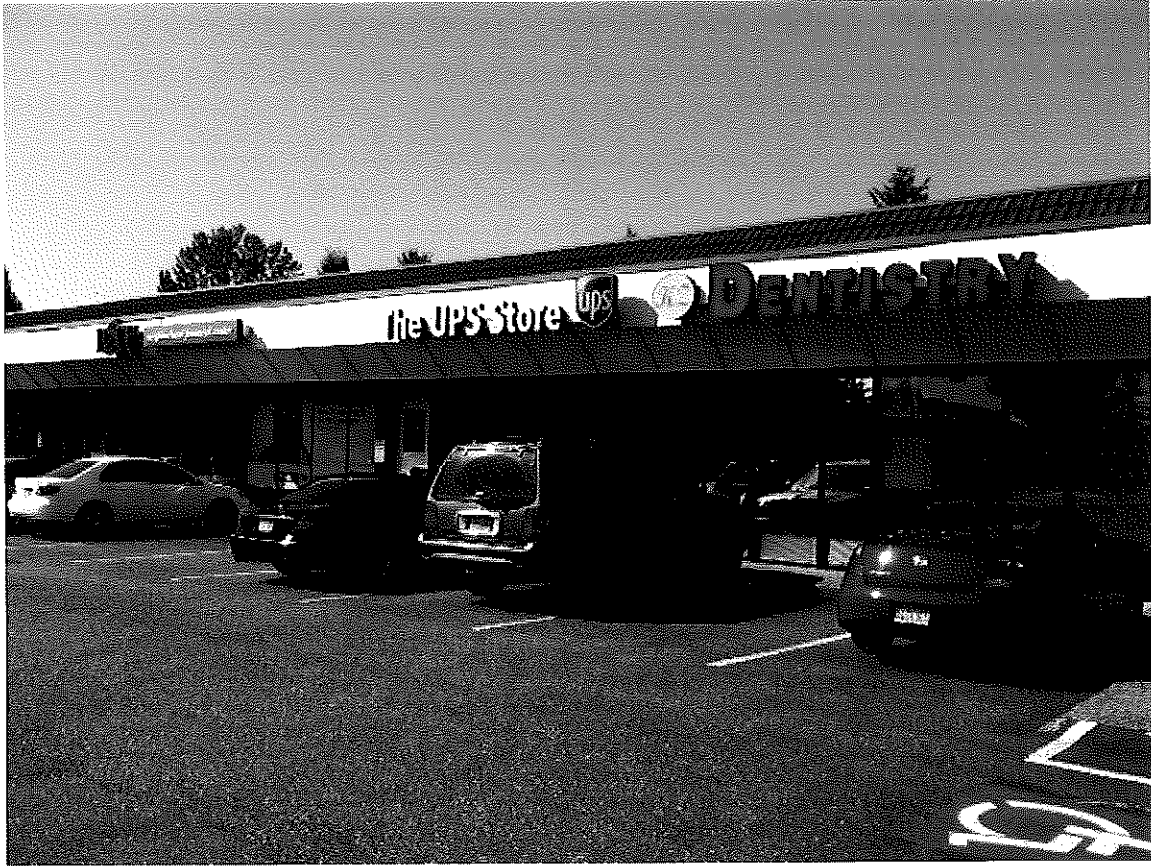
14150 NE 20th Street, Bellevue 98007