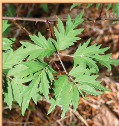
Invasive evergreen blackberry has palmately compound leaves with 3-5 deeply lacerated leaflets.

Evergreen blackberry is another common invasive blackberry species. It can be identified by its palmately compound leaves with 3-5 deeply lacerated leaflets. Native trailing blackberry is smaller, has 3 leaflets, and grows along the ground. It can also be weedy, but does not grow up and over other plants and is not as aggressive as the two invasive blackberry species.