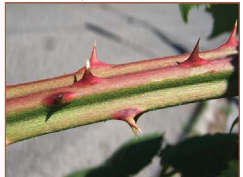
Star-shaped, thorny, arching stems grow 15 feet tall and 40 feet long.