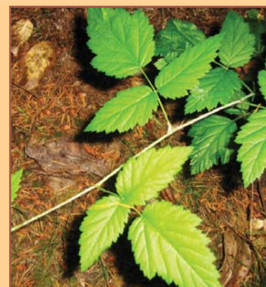
Native trailing blackberry is smaller with 3 leaflets and grows along the ground.