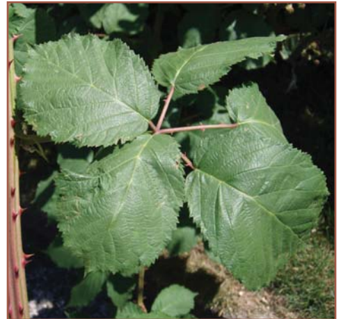
Large, toothed, rounded to oblong leaves usually grow in groups of 5.