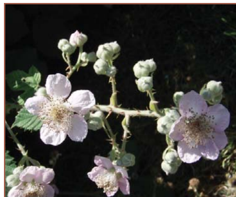
If cutting blackberry once per year, the best time is when the plant is in flower.

After spraying, wait at least one week before cutting down treated blackberry bushes. Chemical control options may differ for private, commercial, and government agency users. For more information, contact the King County Noxious Weed Control Program.