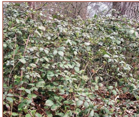
Himalayan blackberry thickets overtake native plants and trees.