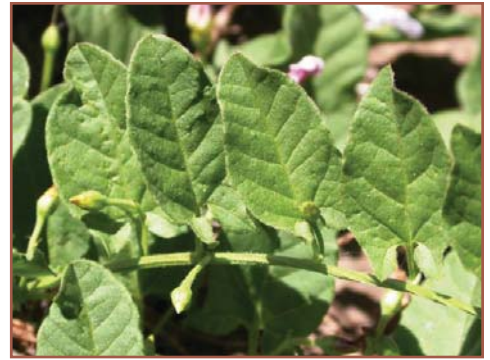
Leaves are smooth and roughly arrowhead-shaped.

Follow all applicable laws and regulations regarding herbicide use on your site, and follow all label instructions carefully. Systemic herbicides can suppress bindweed, especially if combined with careful monitoring for surviving plants. Herbicides can be painted or brushed on leaves to avoid drift onto desirable plants. Products containing glyphosate are effective when applied in the summer and fall before the leaves die back. However, glyphosate is "non-selective" and will injure any foliage that it comes in contact with, including grass. Selective broadleaf herbicides with active ingredient triclopyr or 2,4-D work well for grassy areas, as they won't harm most grasses. Repeat treatment on regrowth as needed. All of the above herbicides are absorbed by foliage and moved throughout the plant to kill roots and shoots. For more information, contact the Noxious Weed Control Program.