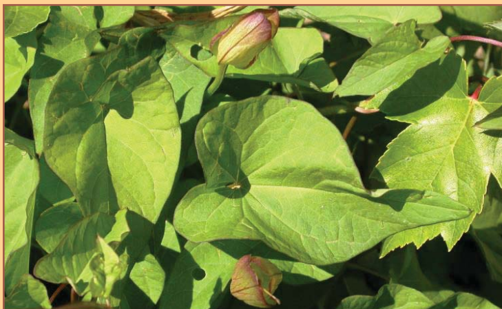
Hedge bindweed leaves are larger, hairless, and more arrow-shaped.

However, hedge bindweed is much more common in urban natural areas and backyard gardens. Hedge bindweed appears very similar to field bindweed, but its flowers and foliage are larger. Also, the leaves are hairless and have a more pronounced arrow shape. Both invasive bindweeds should be controlled whenever possible. Hedge bindweed doesn't have as deep of a root system, so hand-pulling small sites is feasible, but still very labor-intensive. It can also be controlled with the herbicides mentioned above.