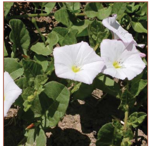
Flowers are trumpet-shaped and range from white to light pink.