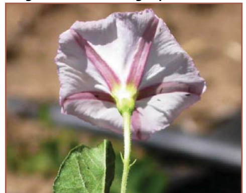
Two small leaf bracts grow about one inch below the flower.