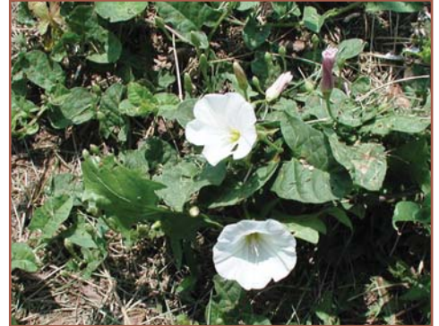
Field bindweed grows along the ground until it finds plants, fences, or other structures to climb onto.