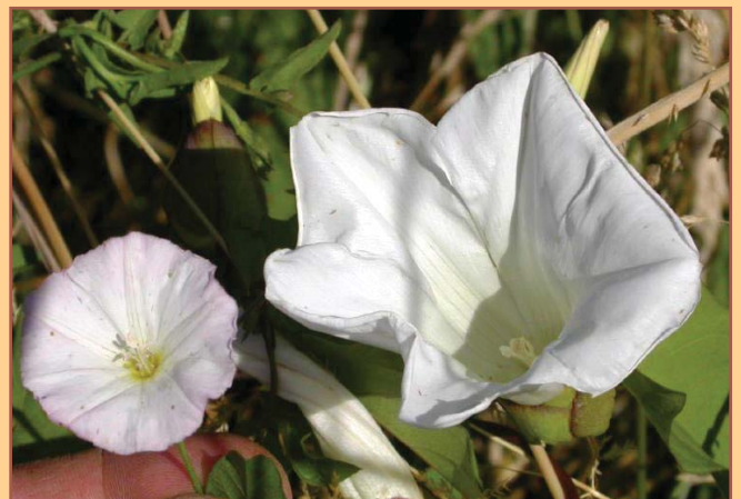
Flowers of field bindweed (left) and hedge bindweed (right).