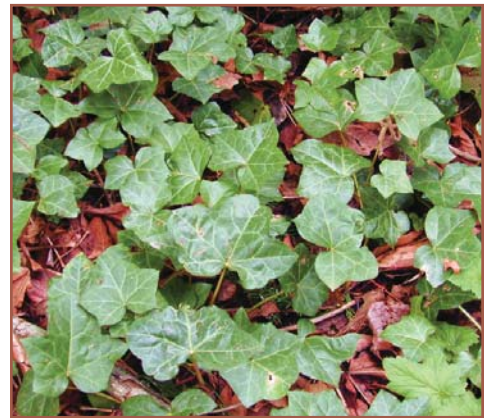
Juvenile ivy leaves are dull green and deeply lobed, with distinct light veins.

Non-Regulated Class C Noxious Weed: Control Recommended