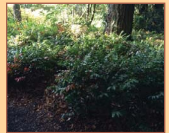
low Oregon grape

For more alternatives, visit the Northwest Plant Guide at kingcounty.gov/gonative .