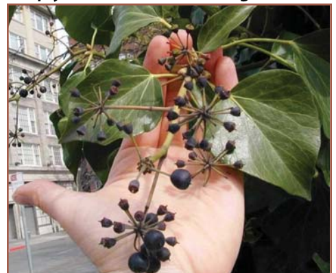
Mature ivy stems have fuller, glossy, unlobed leaves and produce clusters of black fruit.