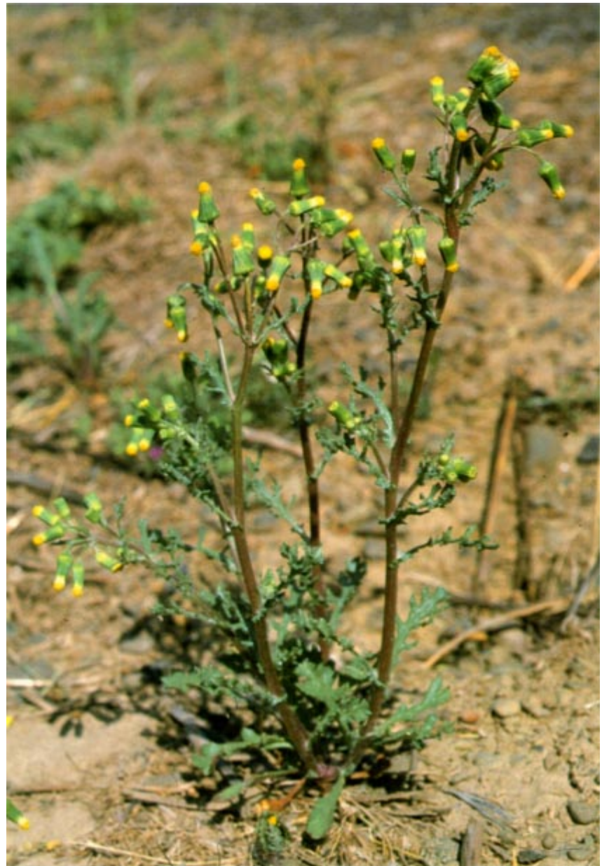
Figure 1.—Common groundsel grows from 4 to 18 inches tall. Leaves are deeply lobed with toothed margins. The lower stems and undersides of basal leaves usually are purplish-colored.

Susan Aldrich-Markham, Extension agent, Yamhill County, Oregon State University.