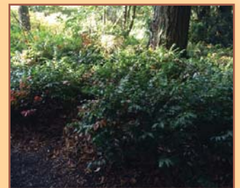
low Oregon grape

For more alternatives, visit the Northwest Plant Guide at kingcounty.gov/gonative .