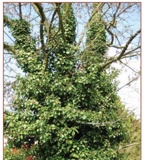
Ivy is an aggressive climber and can topple or severely impact the growth of trees.