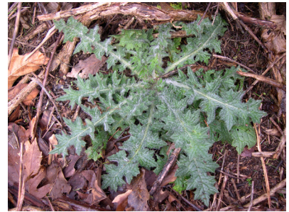
Bull thistle rosette.

Bull thistle is a persistent and troublesome weed that was introduced to North America as a seed contaminant. It is found on every continent except Antarctica. In King County, bull thistle is already so widespread requiring control would not be feasible. However, the King County Noxious Weed Control Board recommends landowners voluntarily control it whenever possible.