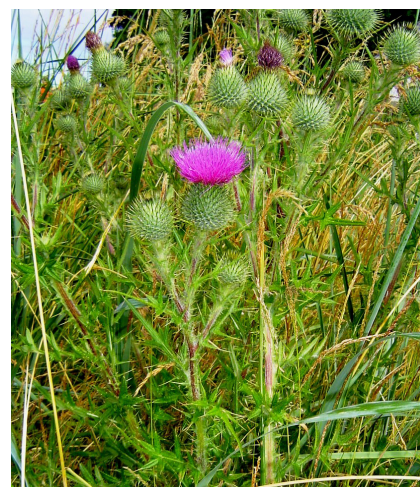
This weed can invade nearly any environment, from beachesides to pastures.