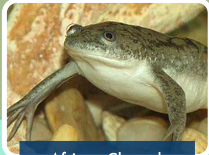
African Clawed Frog