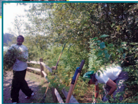
Removing invasive weeds at Cottage Lake

We hope you can hear the wonder and feel their enlightenment and curiosity about the world.