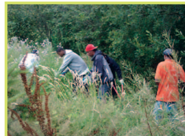
Removal of invasive plants at Pigeon Point restoration site with the Nature Consortium