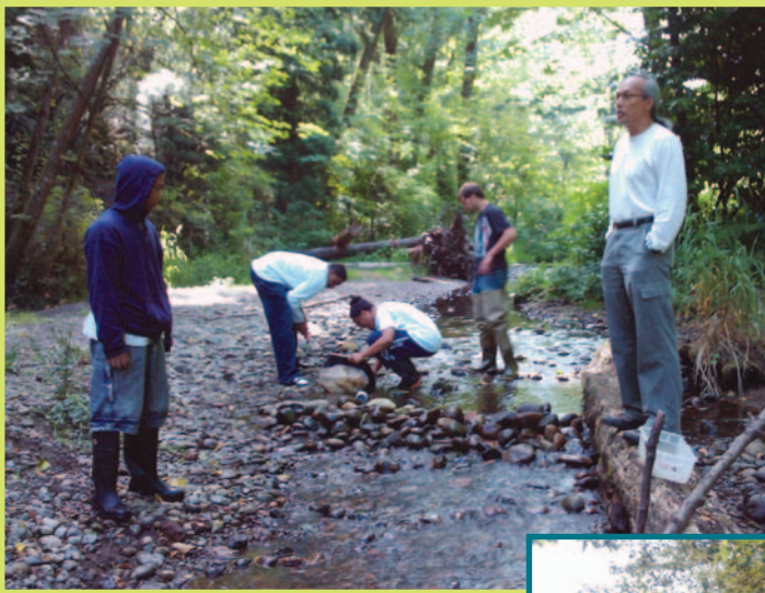
Studying insects at Coal Creek