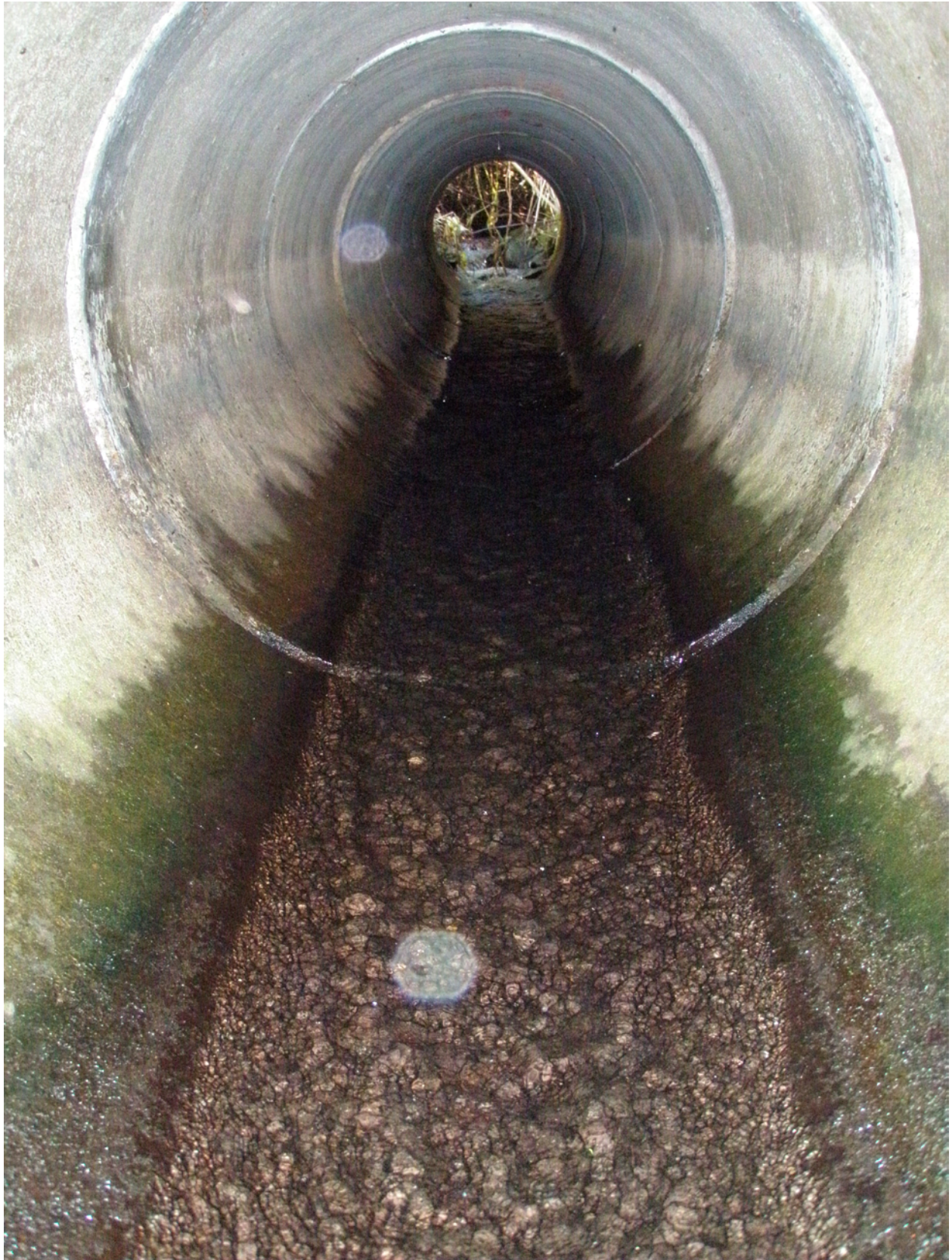
Natural bed material is absent from inside the concrete culvert