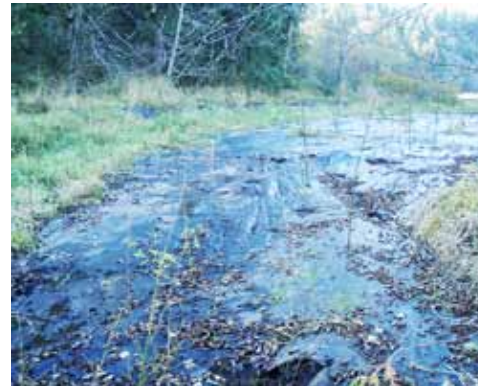
Weed fabric along Patterson Creek

Weed fabric was placed to suppress reed canary grass along 150 lineal feet of the left bank of Patterson Creek in spring 2010. WCC crews planted 3,150 willow and cottonwood livestakes in the fall to enhance 10,500 square feet of Patterson Creek riparian buffer and restore 0.12 acres of wetland. More beaver resistant shrubs and trees will be planted in spring 2011.