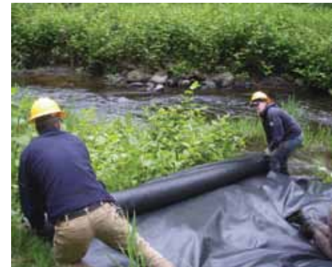
Installing landscape fabric at Bear Creek

1,100 LF of stream bank to restore 3.6 acres of riparian habitat.