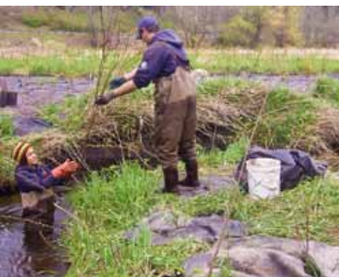
WCC crew planting willow and cottonwood stakes

Weed fabric and plantings of willow and cottonwood were installed along 300 lineal feet of Patterson Creek to enhance 4,500 square feet of riparian buffer and restore approximately 0.23 acres of degraded wetland. Additional planting will occur in spring 2011 by adding beaver resistant species such as Pacific ninebark, Oregon ash and twinberry within the fabric-covered areas.