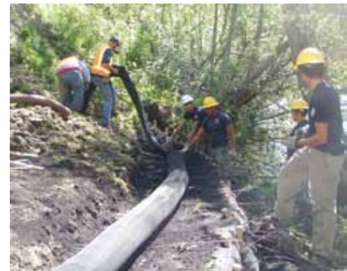
Geotextile "socks" filled with compost

SHRP constructed a bioengineered demonstration project along 80 lineal feet of the Cedar River. Geotextile fabric "socks" were filled with compost and staked into benches that were planted with 225 shrubs. Cedar Grove Composting, Inc. donated the compost for this project.