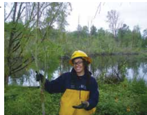
Enhancing Cemetery Ponds' wetlands