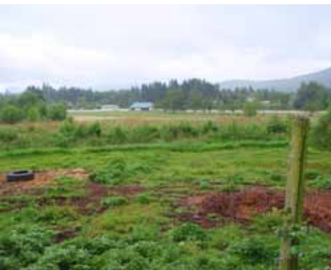
Restoring the riparian buffer at Patterson Creek

Weed fabric and plantings of willow and cottonwood were installed along 300 lineal feet of Patterson Creek to enhance 4,500 square feet of riparian buffer and restore approximately 0.23 acres of degraded wetland. Additional planting will occur in spring 2011 by adding beaver resistant species such as Pacific ninebark, Oregon ash and twinberry within the fabric-covered areas.