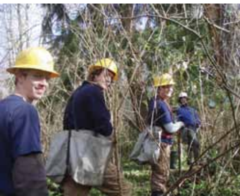
WWC crew planting trees