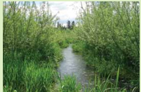
Rosatto Newaukum after restoration

In 2007, the Green-Duwamish Basin Steward, Josh Kahan, asked SHRP staff to help develop a long-term stream corridor restoration plan for Newaukum Creek. This significant tributary to the Green River provides habitat for threatened Chinook salmon, bull trout and steelhead trout as well as coho, chum, and pink salmon, coastal and resident cutthroat trout and rainbow trout. Historical land use practices had stripped the riparian vegetation from the buffer of much of Newaukum Creek, resulting in bank erosion, the establishment of invasive weeds, and a lack of shade and cover.