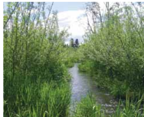
Rosatto riparian buffer restoration project

This is the fourth phase of this invasive species control and riparian buffer restoration project that encompasses 1,025 lineal feet along both sides of Newaukum Creek. WCC crews planted 740 large trees and shrubs in December 2010. Crews also continued maintenance of previous plantings and control of invasive plant species including Himalayan blackberry and reed canarygrass.