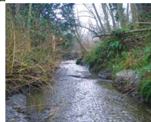
New riparian buffer forest along Judd Creek