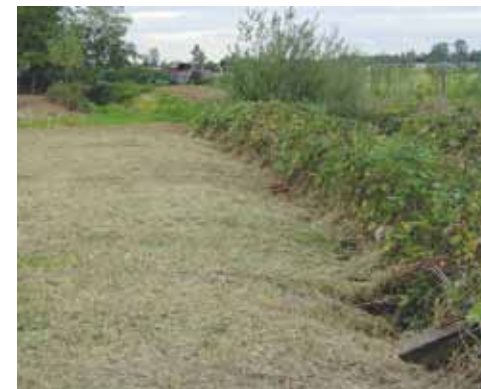
Mowed blackberry bushes at VanWieringen

In 2010 SHRP monitored and maintained one habitat restoration project within WRIA 10.