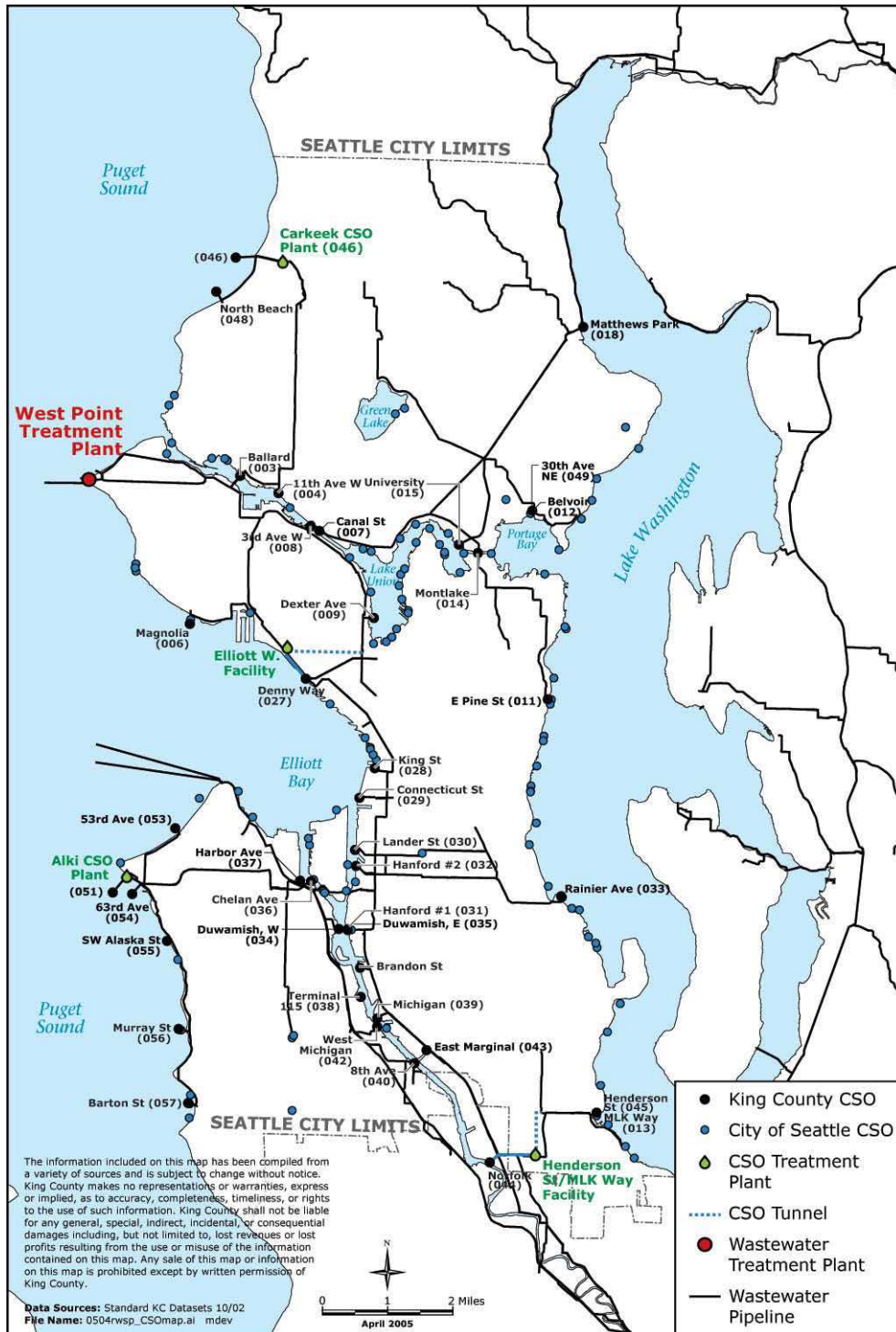
Figure 1. King County CSOs.