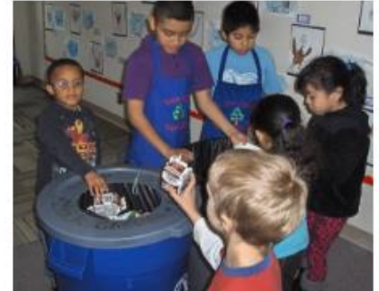
Scenic Hill students recycle milk cartons