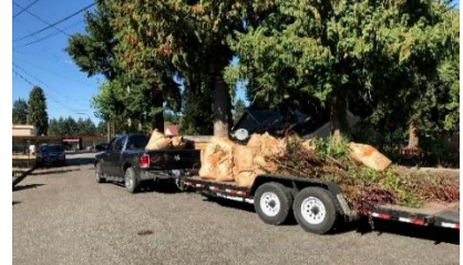
School yard waste collected for composting