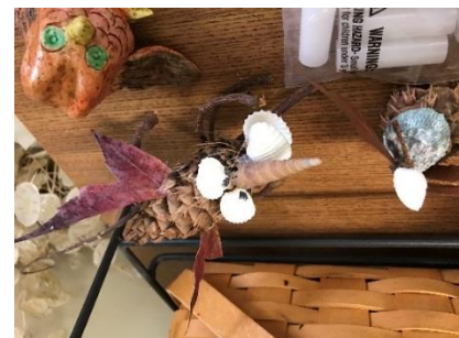
An "earth art" student project using a pinecone, leaves, and shells