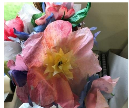
Student reuse art project: Creating a flower using coffee filters