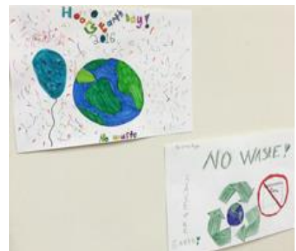
Poster promoting No-Waste Fridays