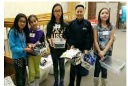
Green Team students helping other students sort recyclable materials