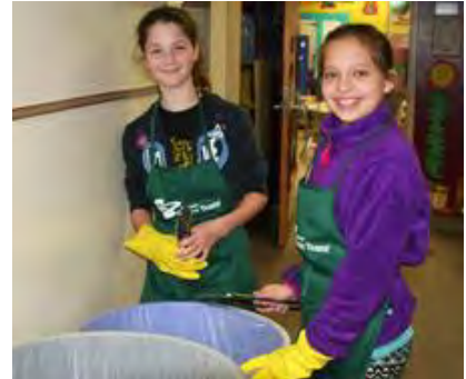
Waste brigade recycling monitors