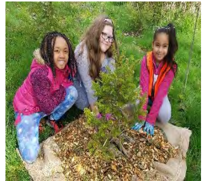
Green Team students participate in Auburn Clean Sweep.