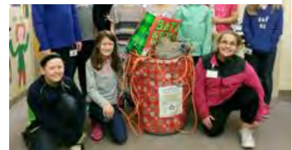
Holiday lights recycling – the collection team