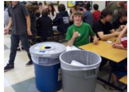
Highland Middle School kicks off improved lunchroom recycling, with containers conveniently located near lunch tables.