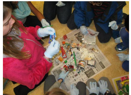
At a King County classroom workshop, Green Team students practiced sorting school waste and identified ways to reduce waste