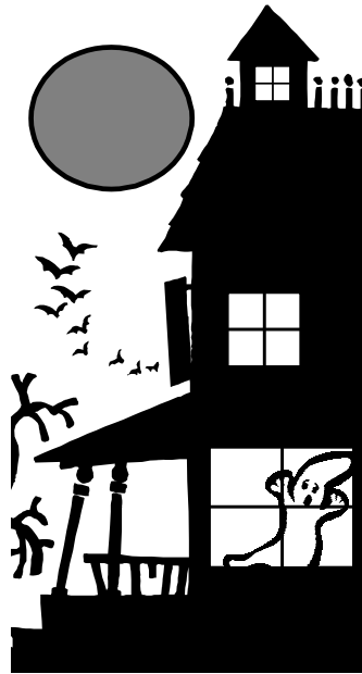
Haunted Pool Party October 29, 2010