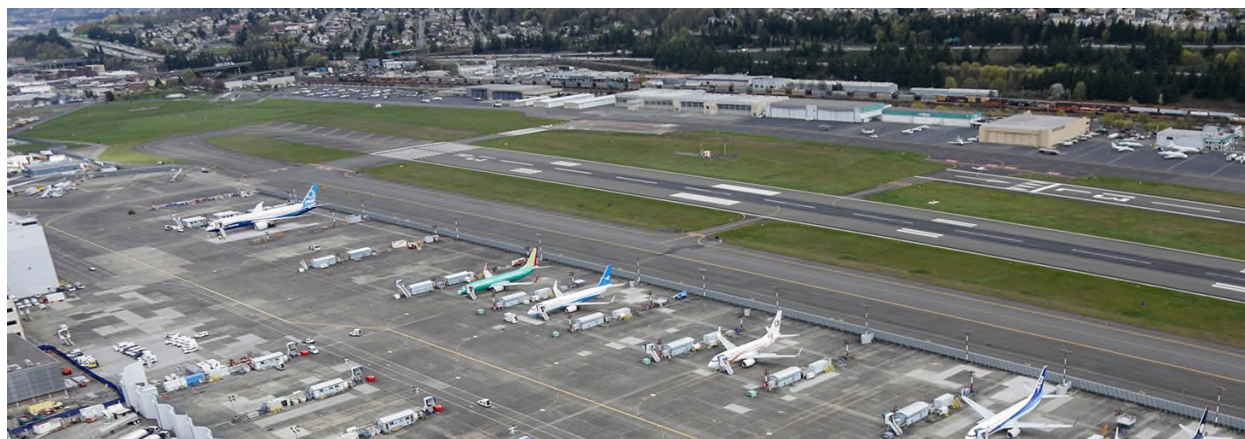
King County International Airport-Boeing Field

226. King County owns and operates KCIA, located at 7277 Perimeter Road South, just four miles south of downtown Seattle. KCIA is one of the nations’ busiest primary non-hub airports and is home to various Boeing Company operations. KCIA covers 634 acres and was Seattle’s main passenger airport from its construction in 1928 until SEA-TAC began operations in the late 1940s. King County has owned and operated KCIA since it opened in 1928.