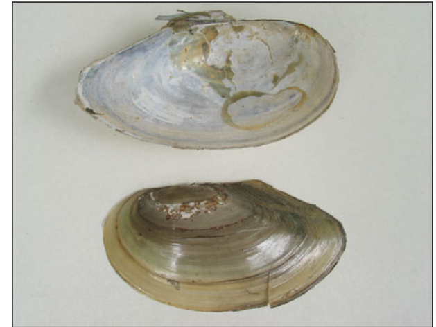
Anodonta oregonensis (Oregon Floater)