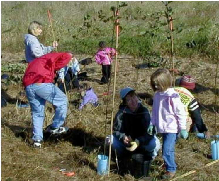
Girl Scouts planting trees during a volunteer work day at the Chinook Bend SHRP project site.

In the Urban Service Area the Small Habitat Restoration Program (SHRP) had 15 active projects, including 4 habitat restoration projects that were constructed, 3 projects that were maintained and monitored, and 3 technical assistance projects. A total of 42,000 square feet, or 0.96 acres, along 360 lineal feet of stream/river bank were restored or enhanced in 2002 in the Urban Service Area in 2002.