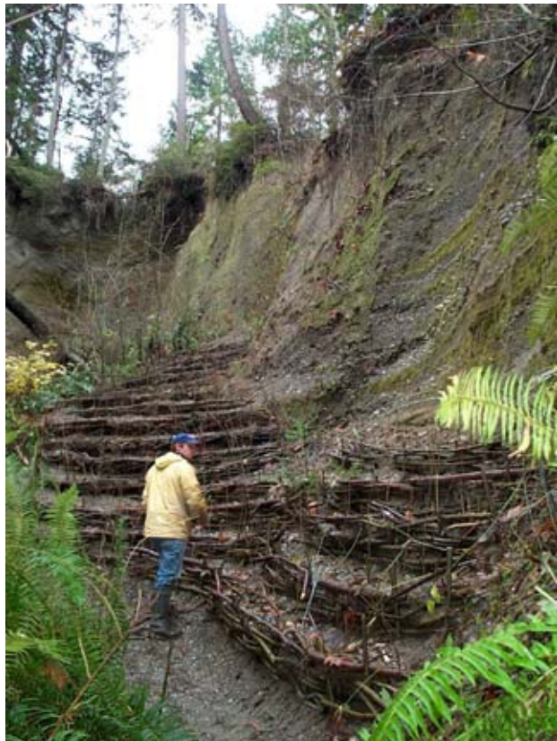
Abel Eckhardt oversees construction of willow fascines at the "Grand Canyon" of Vashon Island

In 2001 a habitat management plan (HMP) was developed for this Vashon Parks district waterfront park. The goal of this project is to stabilize eroding coastal bluffs and banks, and to reestablish a forested coastal plant community of native conifers. Planting of about 7,500 square feet of buffer along 150 feet of shoreline occurred in early 2002.