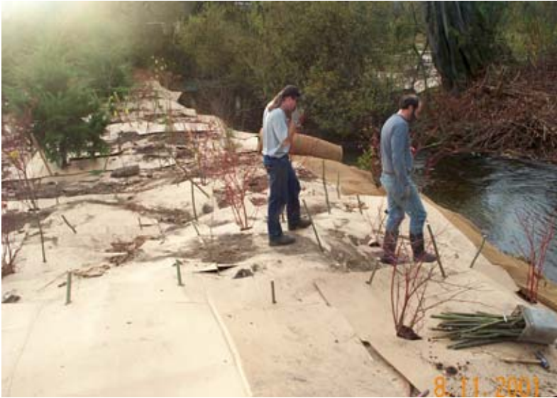
WCC Corps members plant alder in the cardboard sheet mulch on the O'Hanley SHRP project

The goal of this ongoing project is to restore fish and wildlife habitat on 153 acres of private property that include Harris Creek, numerous Class 1 wetlands, and the Snoqualmie River. In 2002 work focused on restoring 3.5 acres of buffer of the Snoqualmie River and on 0.7 Acres of wetland buffer of an off-channel slough. Over 2 acres of blackberry and 1.5 acres of reed canary grass was cut and prepared for planting.