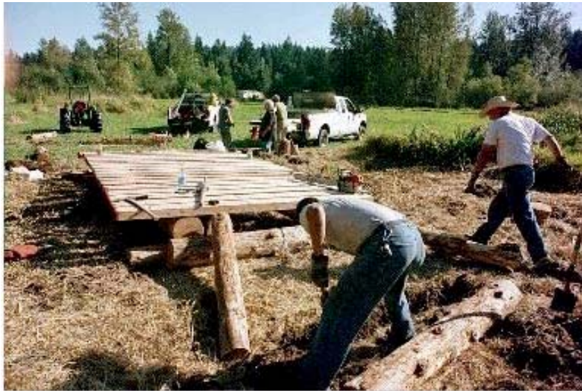
KC Parks crews construct log skidder bridge to provide equipment access on Patterson Trib 383 SHRP project.

This project was awarded a $61,300 matching grant from the National Fish and Wildlife Foundation to fund a stream corridor restoration plan on this tributary to Patterson Creek. This project affects approximately 50,000 square feet (1.14 acres) of streamside buffer and 1,000 lineal feet of a Class 2 salmon-bearing (coho) tributary to Patterson Creek.