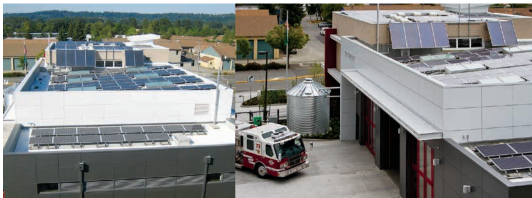
Fire Station 72 in Issaquah uses 70% less energy than typical fire stations in the Northwest.