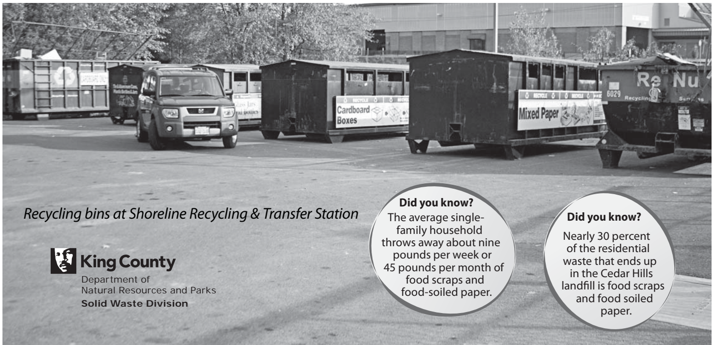
Recycling bins at Shoreline Recycling & Transfer Station