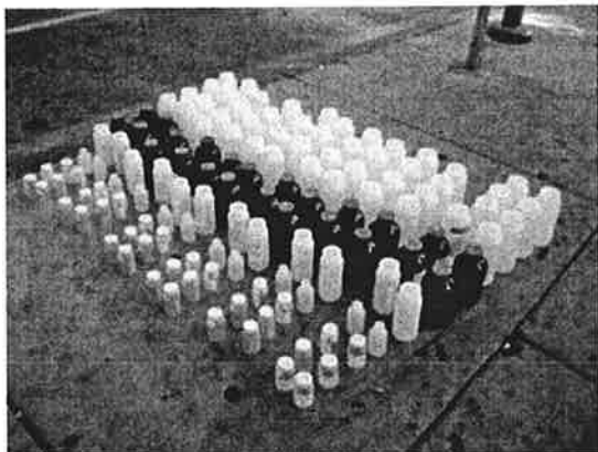
Samples taken during testing

Toxicity of pathogen-destroying media to downstream aquatic life was also a big concern of ours. Iodine is a good example of this. It is very effective at taking care of bacteria, but it can also be highly toxic to downstream aquatic life if not properly controlled.