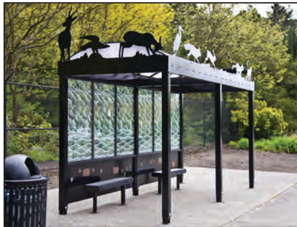
Metro's new zoo bus shelter has animal appeal.