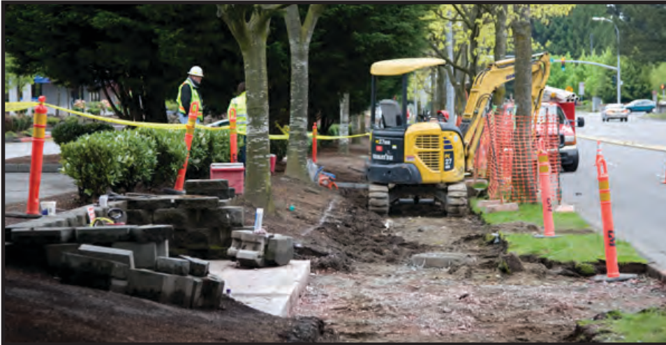
Preparations are underway for new RapidRide shelters on the Eastside.

News briefs in and around the Transit Division