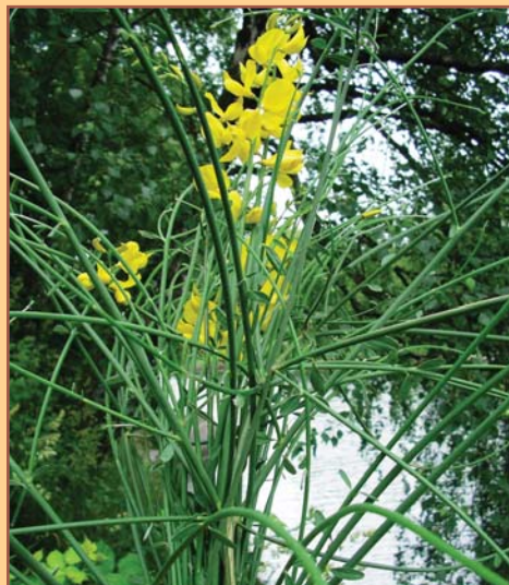
Spanish broom has smooth, round, primarily leafless stems.

While it looks similar to the more common Scotch broom, Spanish broom can be identified by its smooth, round stems and larger, fragrant flowers. This plant is also non-native and highly invasive in the same types of habitat as Scotch broom. It is found in both urban and rural areas where it has escaped ornamental plantings.