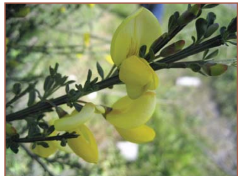
Scotch broom has small, simple or 3-parted leaves, pea-like yellow flowers, and green ridged stems.