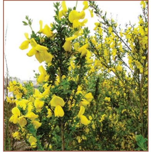
Scotch broom (a.k.a. Scot's broom) was brought to the U.S. from Europe as an ornamental and for erosion control.

Non-Regulated Class B Noxious Weed: Control Generally Not Required*