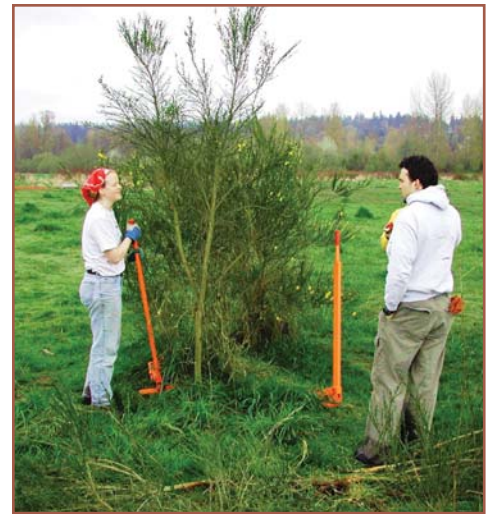
Specially designed weed pullers work well for Scotch broom control.

Follow all applicable laws and regulations regarding herbicide use on your site, and follow all label directions. Foliar herbicide application is most effective after full leaf development and before leaves fall off in summer. Basal or cut stump treatment methods are effective any time. Grass helps suppress Scotch broom seedlings so use a selective broadleaf herbicide if possible. Selective broadleaf herbicides with active ingredients triclopyr, aminopyralid, or metsulfuron work well for grassy areas. Triclopyr is generally considered to be the most effective product for Scotch broom, although it works better on second-year plants than seedlings. Products containing glyphosate are also effective. However, glyphosate is "non-selective" and will kill grass so reseeding or planting will be necessary. Chemical control options may differ for private, commercial, and government agency users. For more information, contact the Noxious Weed Control Program.