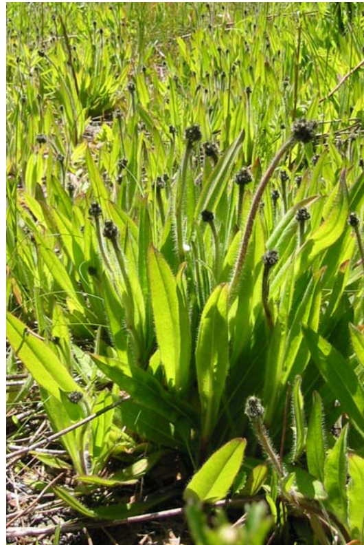
Pre-flowering hawkweeds have dark colored, tightly clustered flowerbuds and fine hairs on the leaves and stems.

Plants can re-sprout from creeping stolons and rhizomes so care should be taken to completely remove the entire root system. Cutting and pulling are ineffective unless done with frequency and diligence to eliminate re-growth. If the plant is in flower, cut off the flower head, bag and dispose of it into the regular trash. Hawkweeds can form viable seeds after they are cut or dug up. Mowing is not recommended. Mowed plants respond by quickly flowering again. Mechanical: Regular tillage will help control hawkweeds on agricultural lands. But care must be taken to pick up any stolons and rhizomes as they can quickly re-sprout. Chemical: Follow labels exactly as written and only use products appropriate and legal for the site. Glyphosate (such as Roundup) is effective but is a non-selective herbicide that will also kill grasses in the area being sprayed. When using a non-selective herbicide, you must re-seed with desirable vegetation. Bare areas will re-infest from existing seed bank and any missed hawkweed plants. Triclopyr (such as Brush B Gone) is a selective herbicide that targets only broadleaf plants so it may be used in grassy areas. Treatment is most effective in the spring and early summer. Apply the herbicide to entire leaf and stem surface of actively growing plants. For more information, please contact the King County Noxious Weed Control Program.