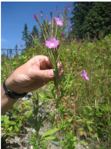
Hairy willowherb is an invasive intruder that needs to be removed.

Why worry about the confusion? Hairy willowherb is an invasive, non-native plant to the Pacific Northwest, while fireweed is a native, beneficial plant that is welcome within the landscape. It quickly colonizes open areas after fires, helping to stabilize the soil and prevent erosion. Fireweed was once used by native Americans as a vitamin source and to heal cuts.