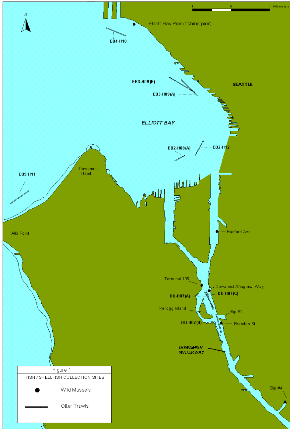
Figure 4-2. Biological Sampling Locations